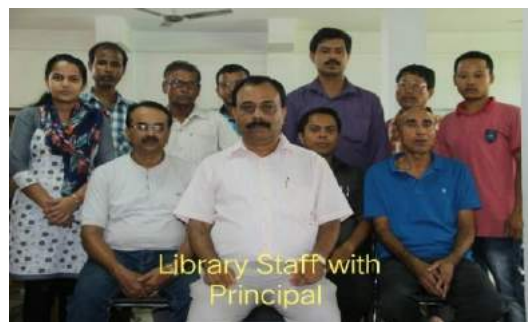
Library Staff with Principal

Moreover, each department has arranged its own departmental library to provide the necessary books for the poor and the needy students on loan basis. A photostate machine is installed in front of the library for providing photocopies of different articles papers at minimum rate.